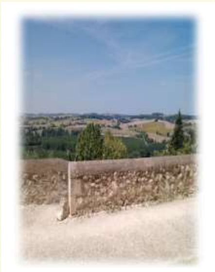
View of Gascony from the ramparts of Lectoure, Southwest France.

○ SLOW TRAVEL. SLOW FOOD. SLOW ENGLISH. ○